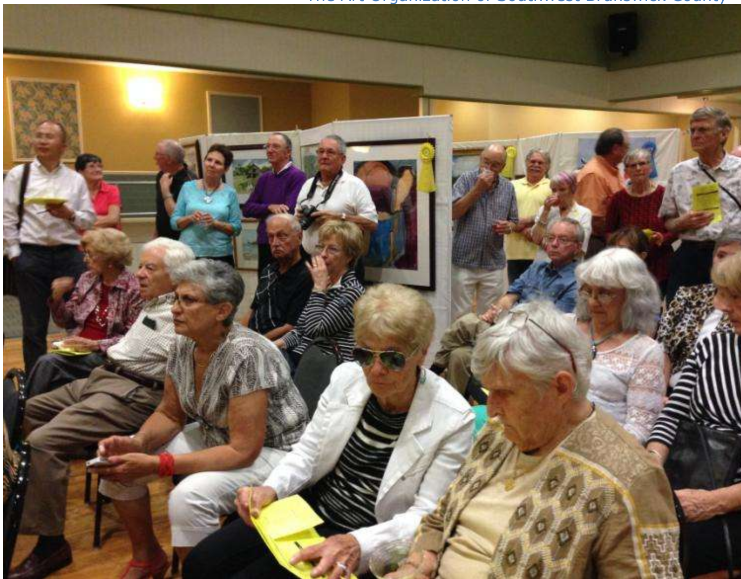
Audience members hang onto the judge's words as the show winners are announced.