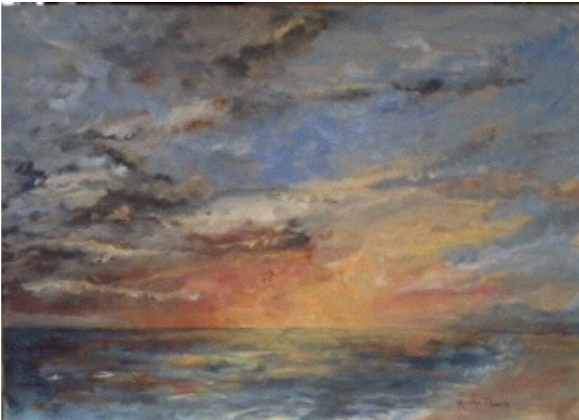
Title: SUNSET AT SUNSET Size: 40x30 Medium: Oil For Sale: $1700