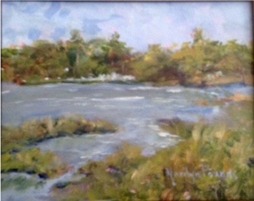
Title: Calabash Bliss Size: 9" x 12" Medium: Oil For Sale: $100 + shipping